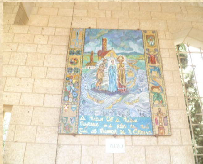
Drawing of Interpretation of Annunciation by Ireland