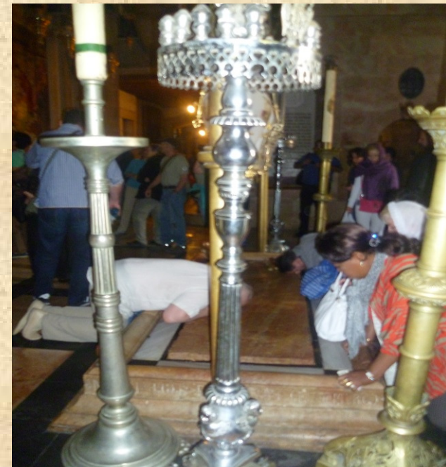
Stone of Anointing