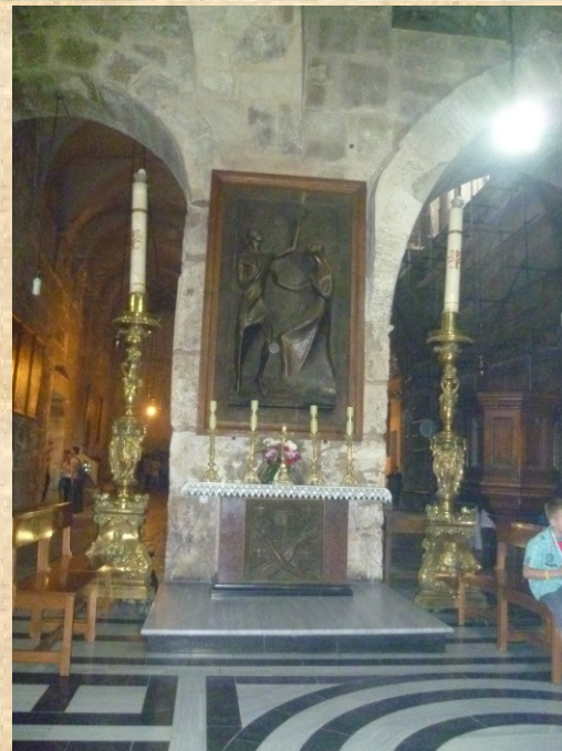
Church of Mary